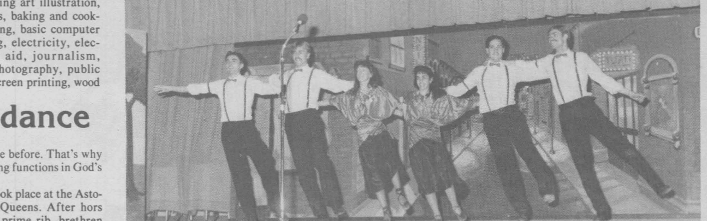
SINGLES IN STEP — Toronto, Ont., singles stage "Give Our Regards to Broadway" April 26. The group plans to present the production to senior citizen's homes and hospitals in the Toronto area.